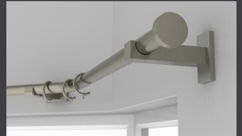
modern styling in brushed nickel