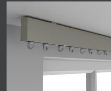
sleek flat track