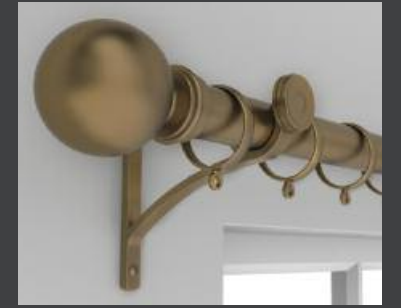
classically styled brass poles