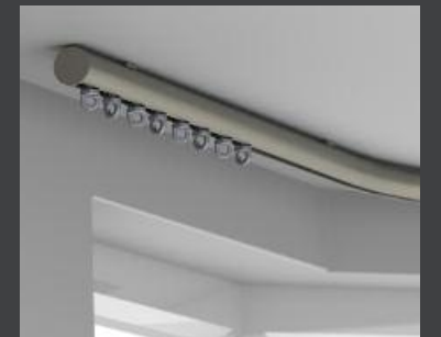
discreet round track