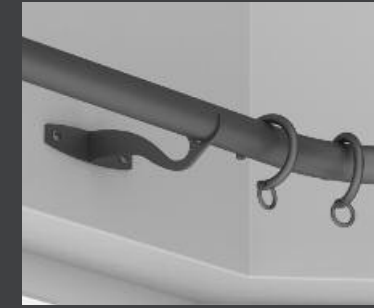
traditional waxed poles

made to measure cutting & bending ⌘ 48 hours from order to dispatch*