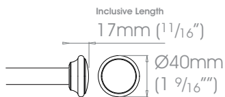
17mm (3/4") Flared Disc